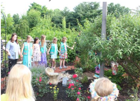
Blessing of the Peace Garden at the rededication ceremony in June 2018.