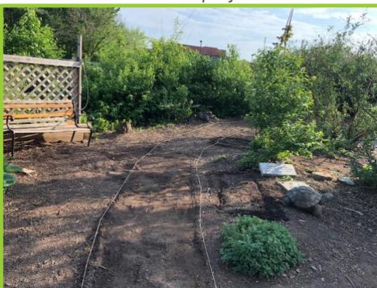
(Above) During the pathway design.