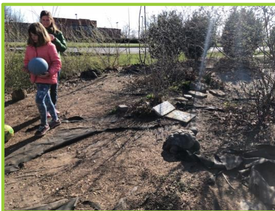
(Above) The Peace Garden site before we started the project.