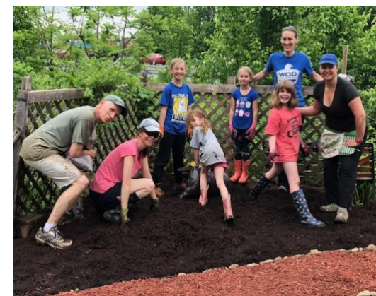
Girl Scouts troop #81151 and parent volunteers pose for a picture in the Peace Garden.

Located at 7215 Corporate Court Drive Frederick, Maryland 21703